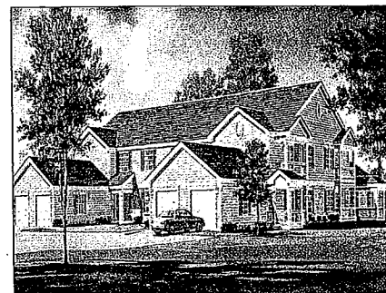
GrandeVille at Cascade Lake will feature 276 units.

GrandeVille at Cascade Lake is LeCesse's third venture in Minnesota. Grand Reserve at Eagle Valley in Woodbury, Minn., a 394-unit property, was completed in 1999. City Walk, also in Woodbury, includes 287 residential units, retail and office space. Weis Builders constructed both of LeCesse's earlier Minnesota projects.