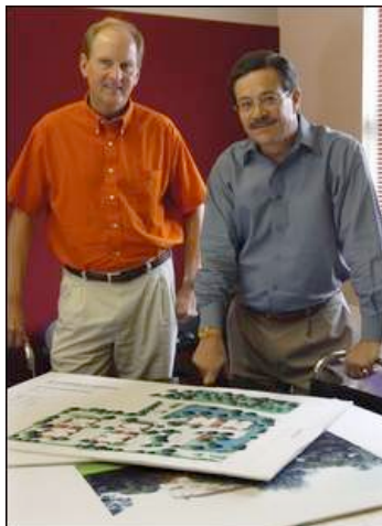
Zoom | Order print

LeCesse hopes to get City Commission approvals and begin work on